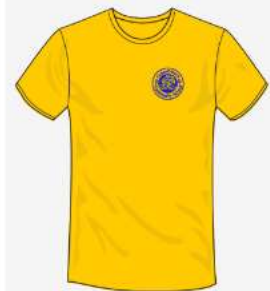
Yellow PE Shirt