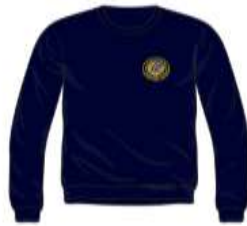
Blue Jumper with school logo either V-Neck or Crew Neck