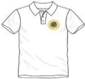
White Polo Shirt