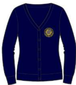
Blue Cardigan with school logo