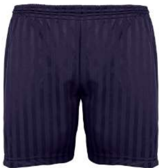
Blue PE Shorts