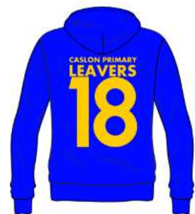
Year 6 Leavers – Optional