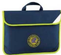
School Bag Optional